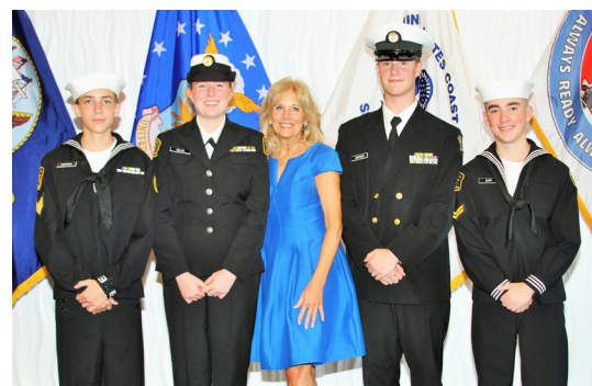
The Coca-Cola Company